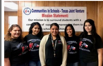
Meet your CIS-ACE staff! ♥