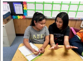
Math strategies during Homework Help. 😊