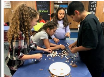
Students building towers during Team Building activity.