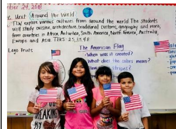
Students learning interesting facts about our USA flag!