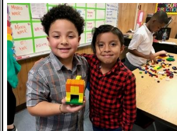
Students creating Safari animals out of LEGOS!!!!