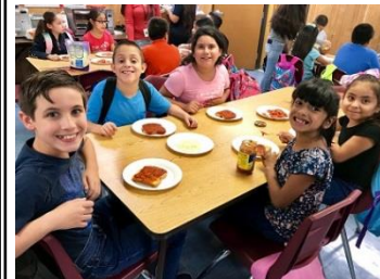
Kid's Kitchen Club baking pizza toasts!! "Yummy!!"