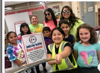
Smile for the selfie!! Because Our Future Is Bright In CIS-ACE!