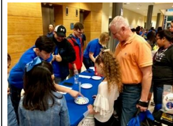
Red Bluff ACE family during our CIS STEM Expo!!