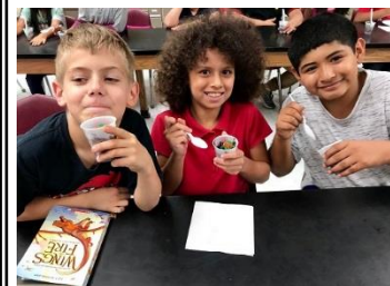
3 rd and 4 th grade students making Pumpkin Dirt Cups.