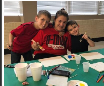
Painting with the Twist with the Dove Family! 😊