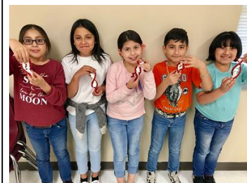
Edible DNA structures with 3 rd grade students.