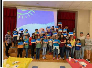
Families with their master piece during Parent Event!