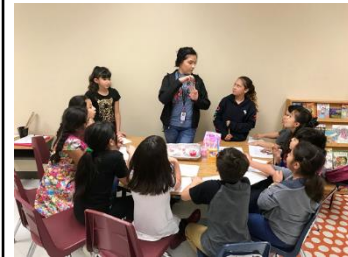
3 rd grade students during our Dancing Hearts activity.