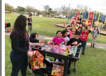
ACE Store!!! Students eager to purchase items 😊