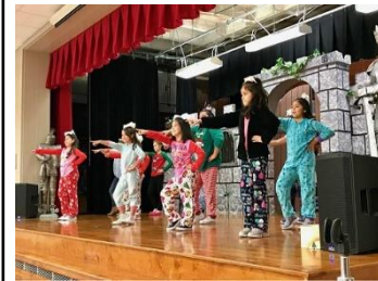
RBE CIS-ACE dance girls. Their first performance!!!! 😊