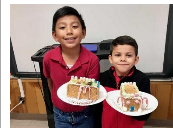
2 nd Grade students making gingerbread houses!!