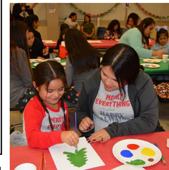
3 rd and 4 th grade students during bottle explosion.