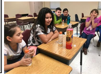
2 nd grade students making DIY lava lamps.