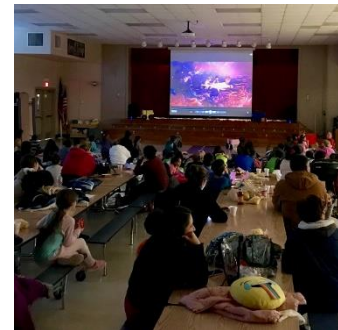
Drive-In Movie Night!