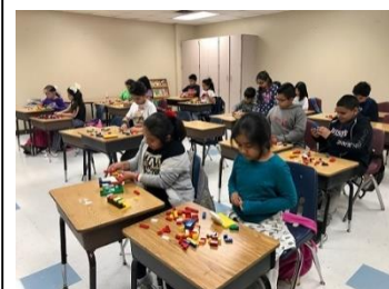
3 rd grade students practicing math using Legos.