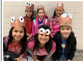
Turkey hats; created by students in Art Club.