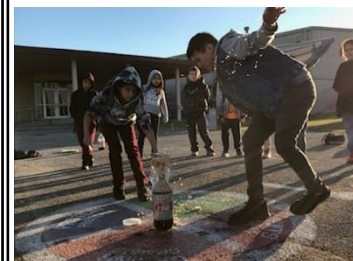
3 rd and 4 th grade students during bottle explosion.