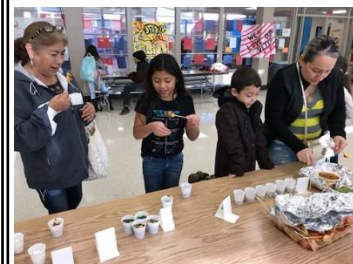
Students and parents during our "Fall Festival" 😊