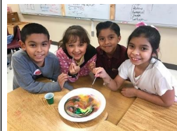
2 nd grade students during a STEM Club activity 😊