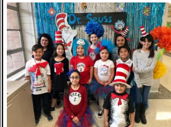
"Oh, The Places You'll GO!" -Celebrating Dr. Seuss Day