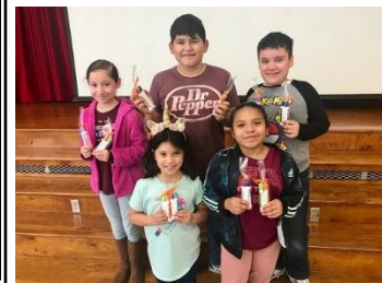
Student Voice and Choice students with teacher gifts!